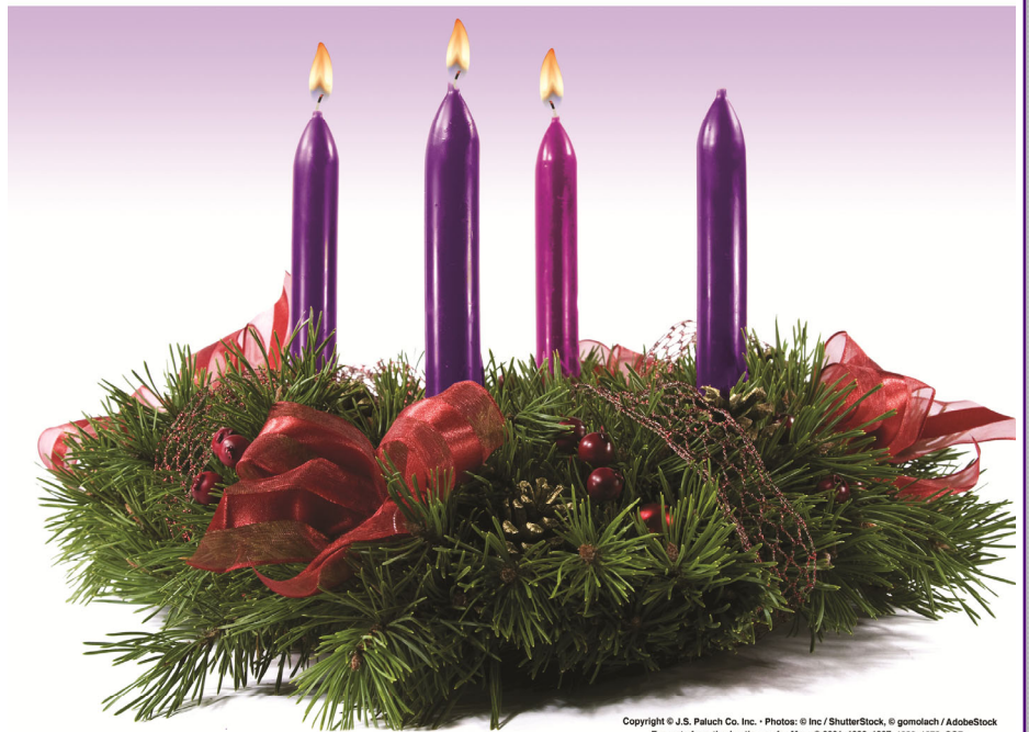
Copyright © J.S. Paluch Co. Inc. Excerpts from the Lectionary for Mass © 2001, 1998, 1997, 1986, 1970, CCB.